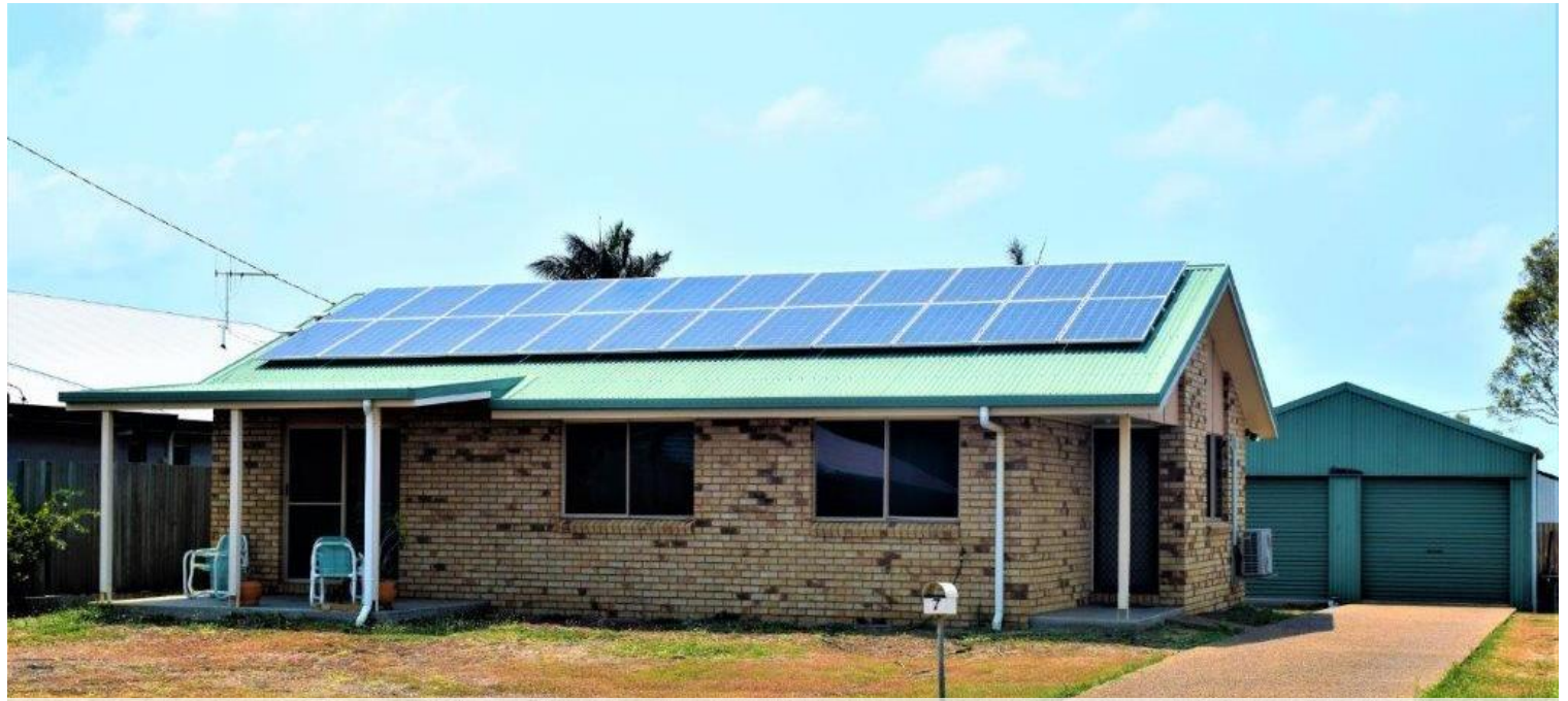
7 Spray St, Burnett Heads